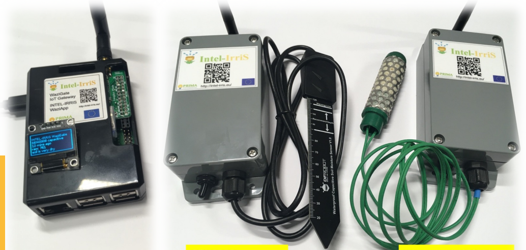
SEN0308 capacitive sensor

Connect to WaziGate WiFi or flash QR code displayed on OLED